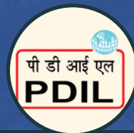
Projects & Development India Limited