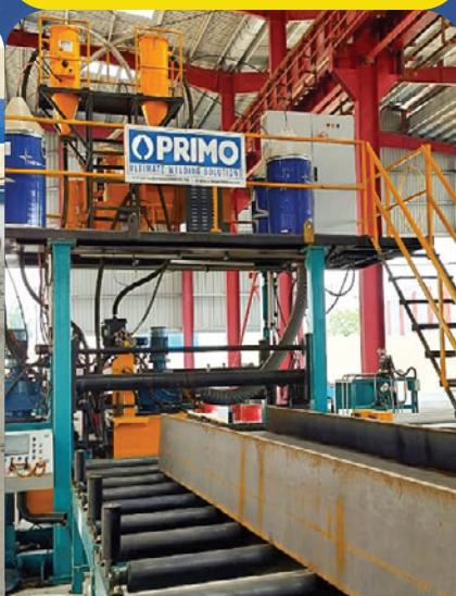
PTW H-Beam Saw Machine