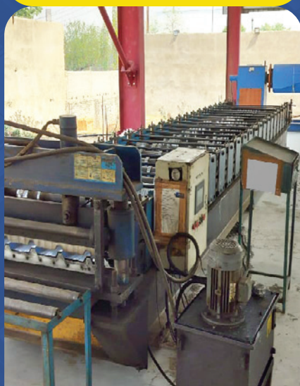
Roof Profile Machine