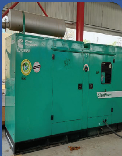
DG Set 125 KVA

We invest in cutting-edge machinery to ensure the precision, speed, and quality of every steel component. Our state-of-the-art equipment allows us to deliver highly accurate and durable products, meeting the stringent standards of the industry while enhancing operational efficiency.