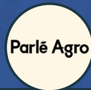
Parle Agro Ltd.